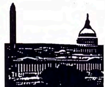
LIKENESS (IMAGE) - USA