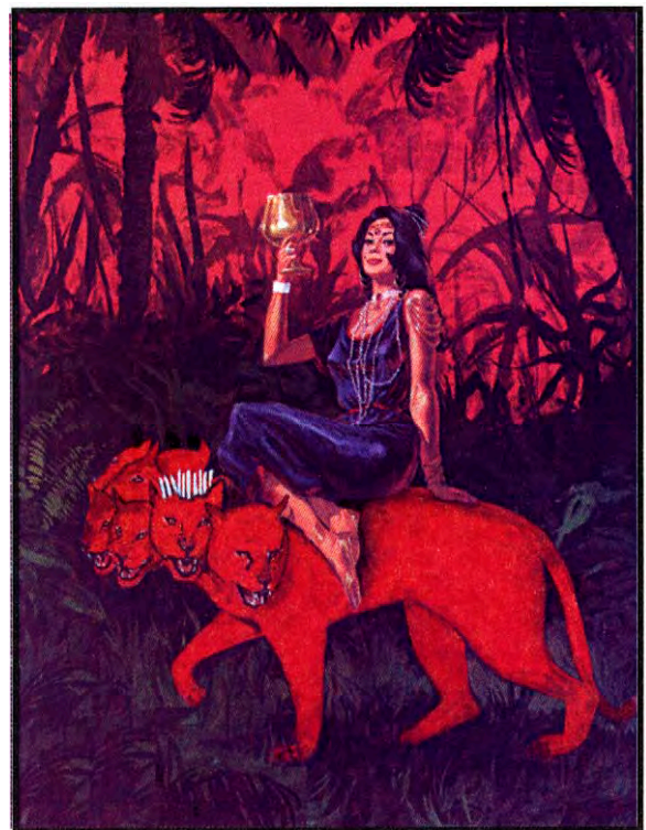
The Woman Riding The Seven Headed Beast

When the Spaniards came to the new world, they found that the Aztecs, Incas and Maya Indians all worshipped the Sun and were horrified in the manner Aztecs sacrificed their human victims. It was recorded at the dedication of their great temple, 20,000 captives were sacrificed in four days.