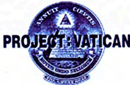
NEW WORLD ORDER