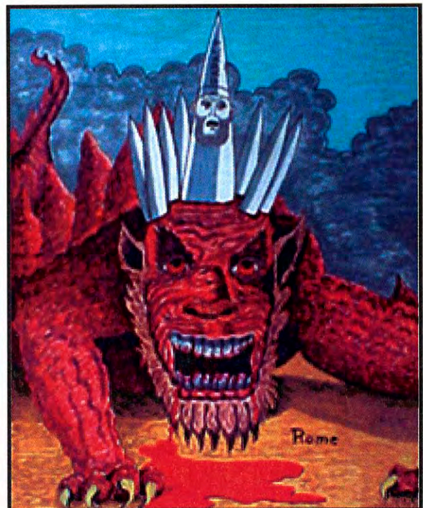
The Symbol of Rome

“And the kingdom and dominion, and the greatness of the kingdom under the whole heaven, shall be given to the people of the saints of the most High, whose Kingdom is an everlasting Kingdom, and all dominions shall serve and obey Him.” (Daniel 7:19-27)